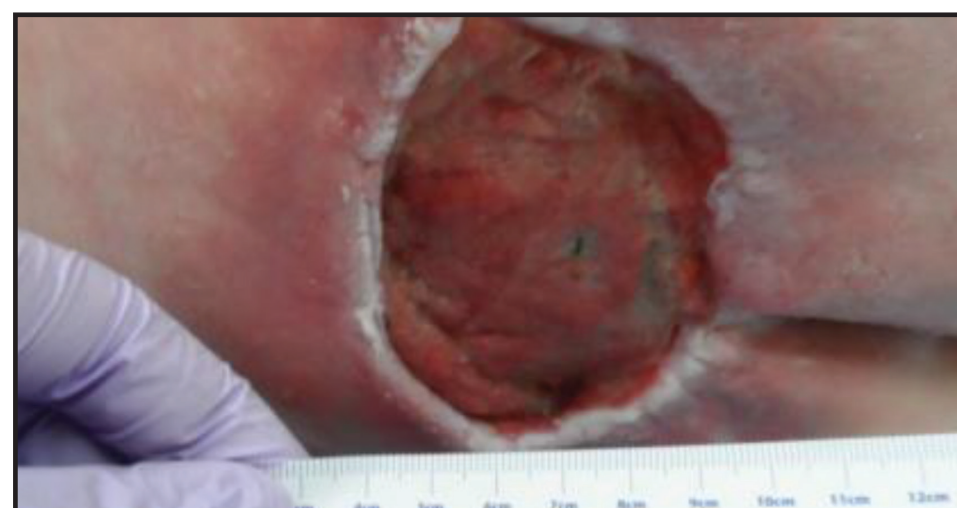
June 2014 During supplementation with L-arginine based oral supplement (4.7cm x 7.5cm x 1.4cm)