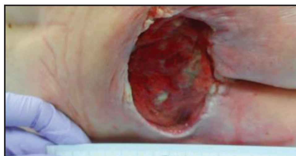
August 2014 Supplement temporarily discontinued (6cm x 7.4cm x 1.1cm)